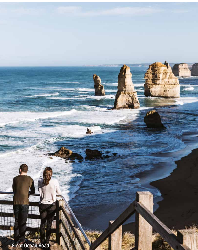
Great Ocean Road